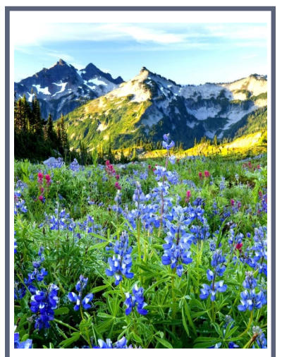
HERE ARE SOME FUN FACTS ABOUT JANUARY: